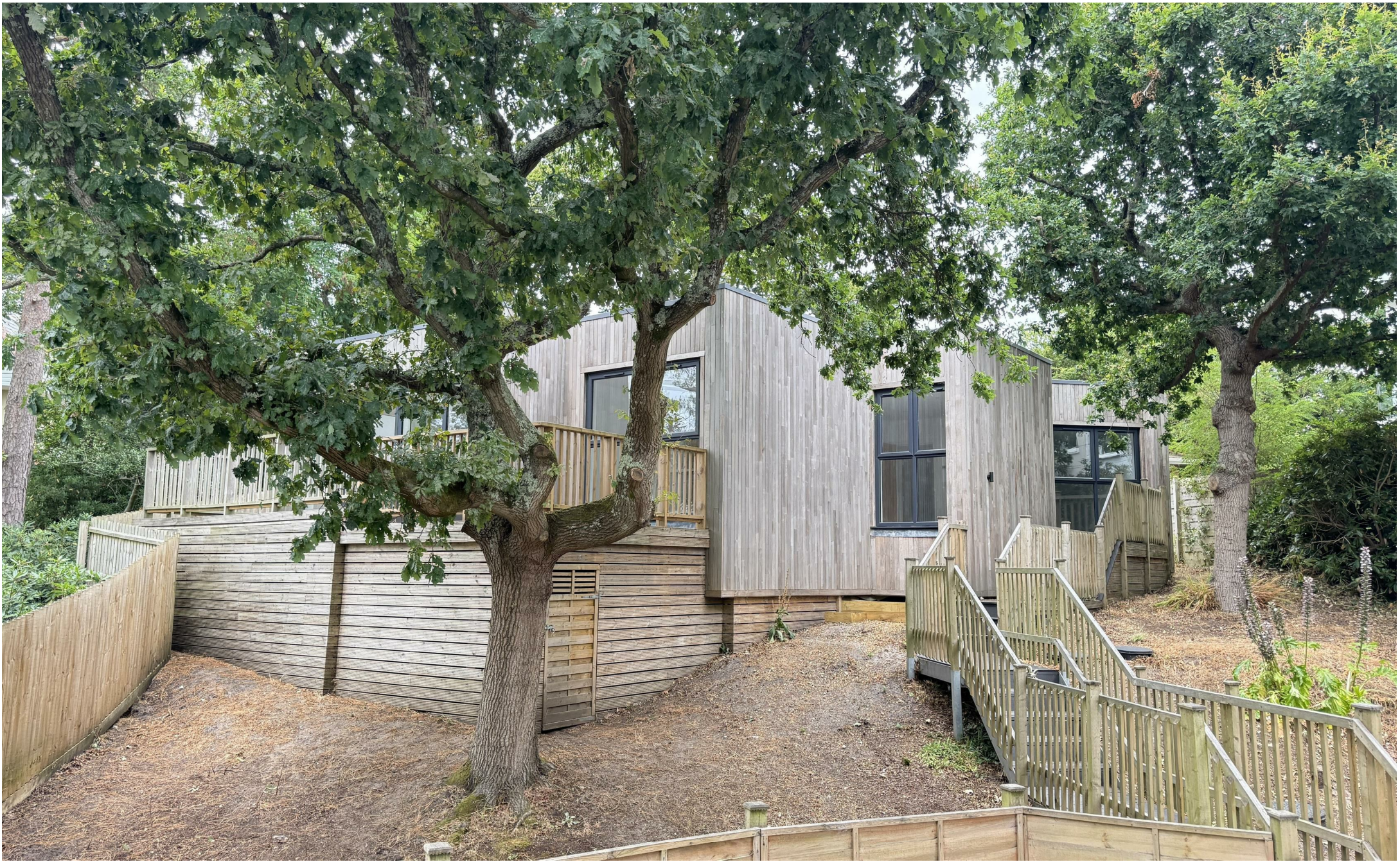
The Treehouse 4 Highmoor Road, Lower Parkstone, Poole BH14 8SZ Guide Price £595,000 Freehold