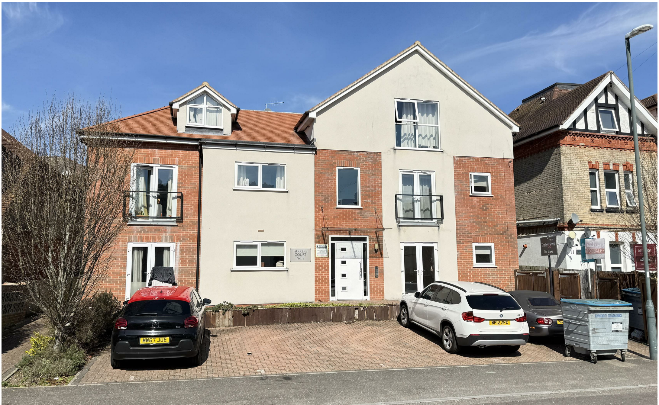
Flat 10 Parkers Court, 9 Frances Road, Bournemouth BH1 3RY Guide Price £145,000 Share of Freehold