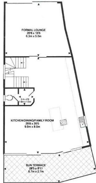
1ST FLOOR APPROX. FLOOR AREA 1012 SQ.FT. (94.8 SQ.M.)