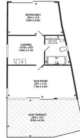
TOP FLOOR APPROX. FLOOR AREA 886 SQ.FT. (81.8 SQ.M.)