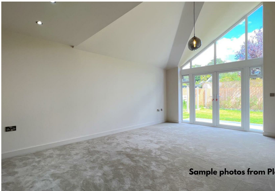
Sample photos from Plot