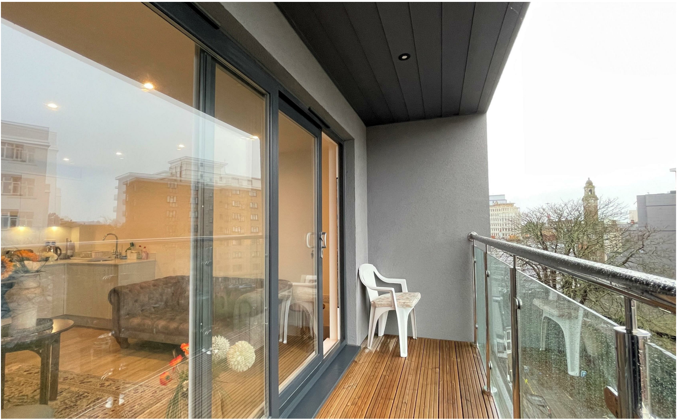
Statum Wootton Mount, Bournemouth, Dorset BH1 1PJ £205,000 Share of Freehold