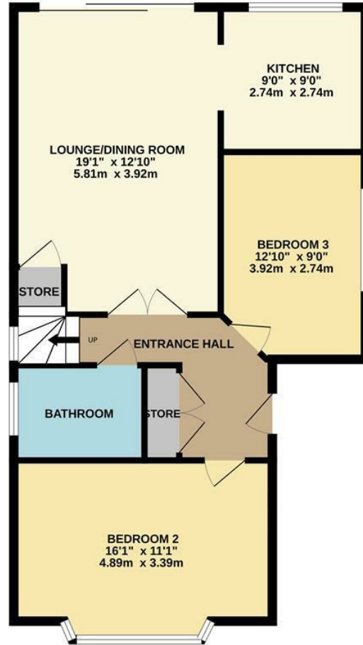
GROUND FLOOR 747 sq.ft. (69.4 sq.m.) approx.