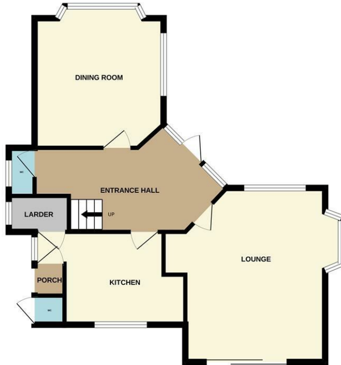
GROUND FLOOR 623 sq.ft. (57.9 sq.m.) approx.