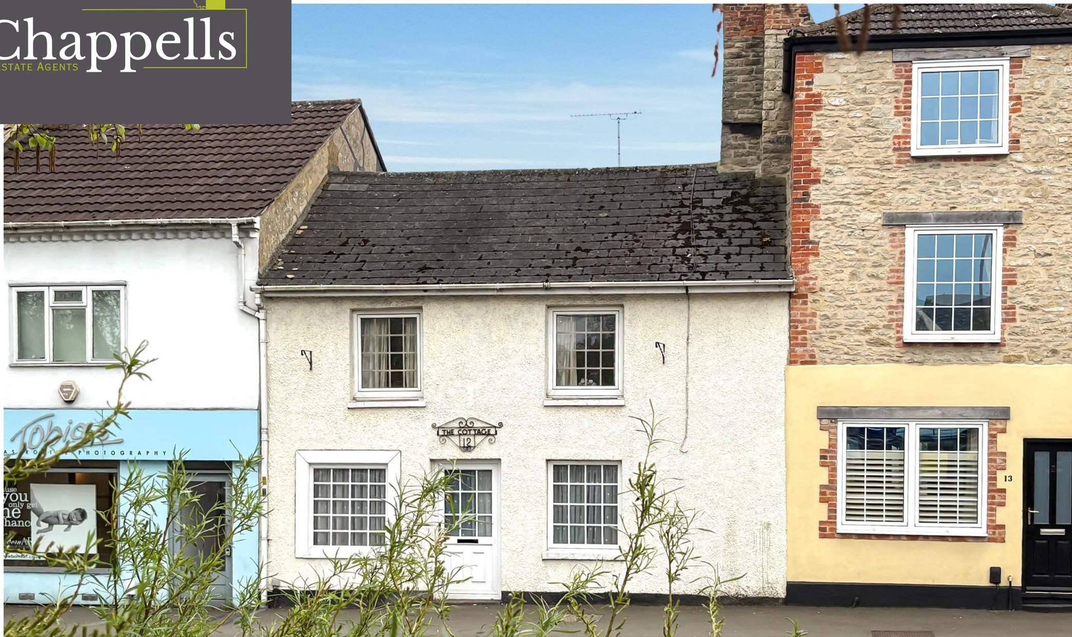
The Cottage, 12 Newport Street, Old Town, Swindon, SN1 3DX