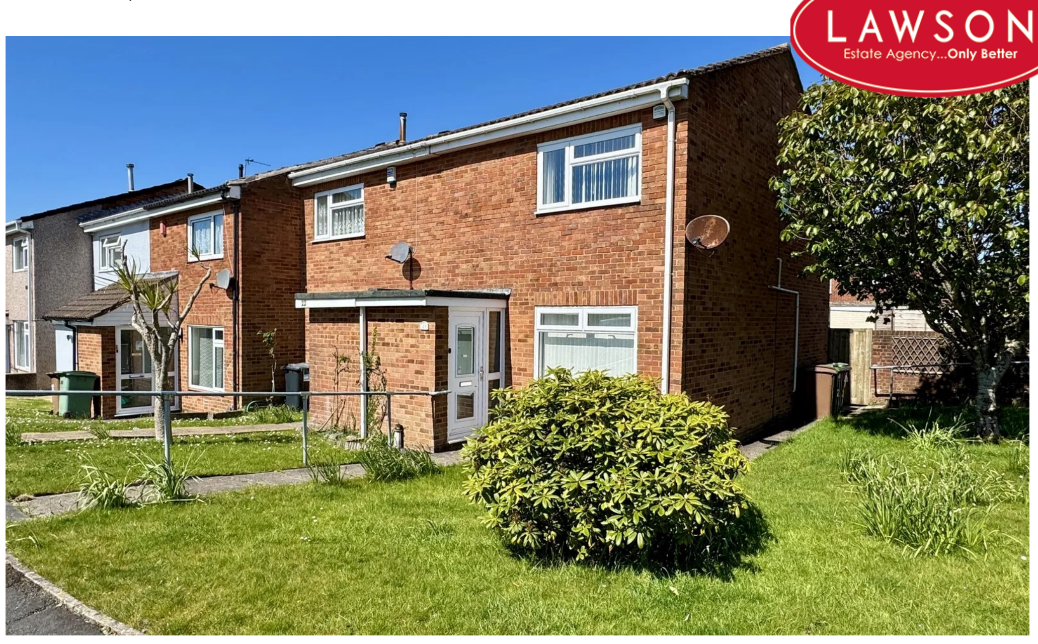
23 WENTWOOD GARDENS, THORNBURY, PLYMOUTH, PL6 8TD