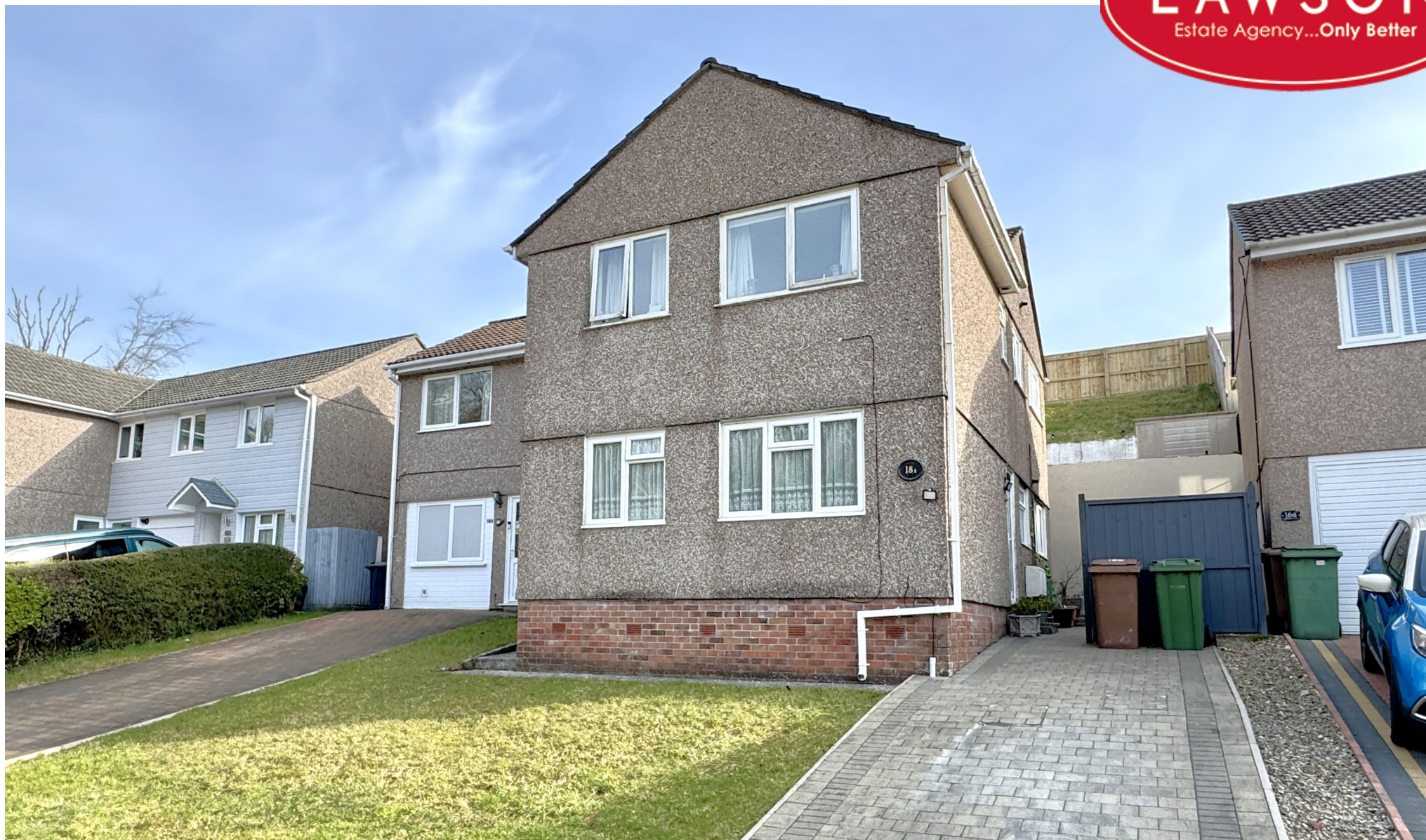
18B BARNINGHAM GARDENS, BIRDCAGE FARM, PLYMOUTH