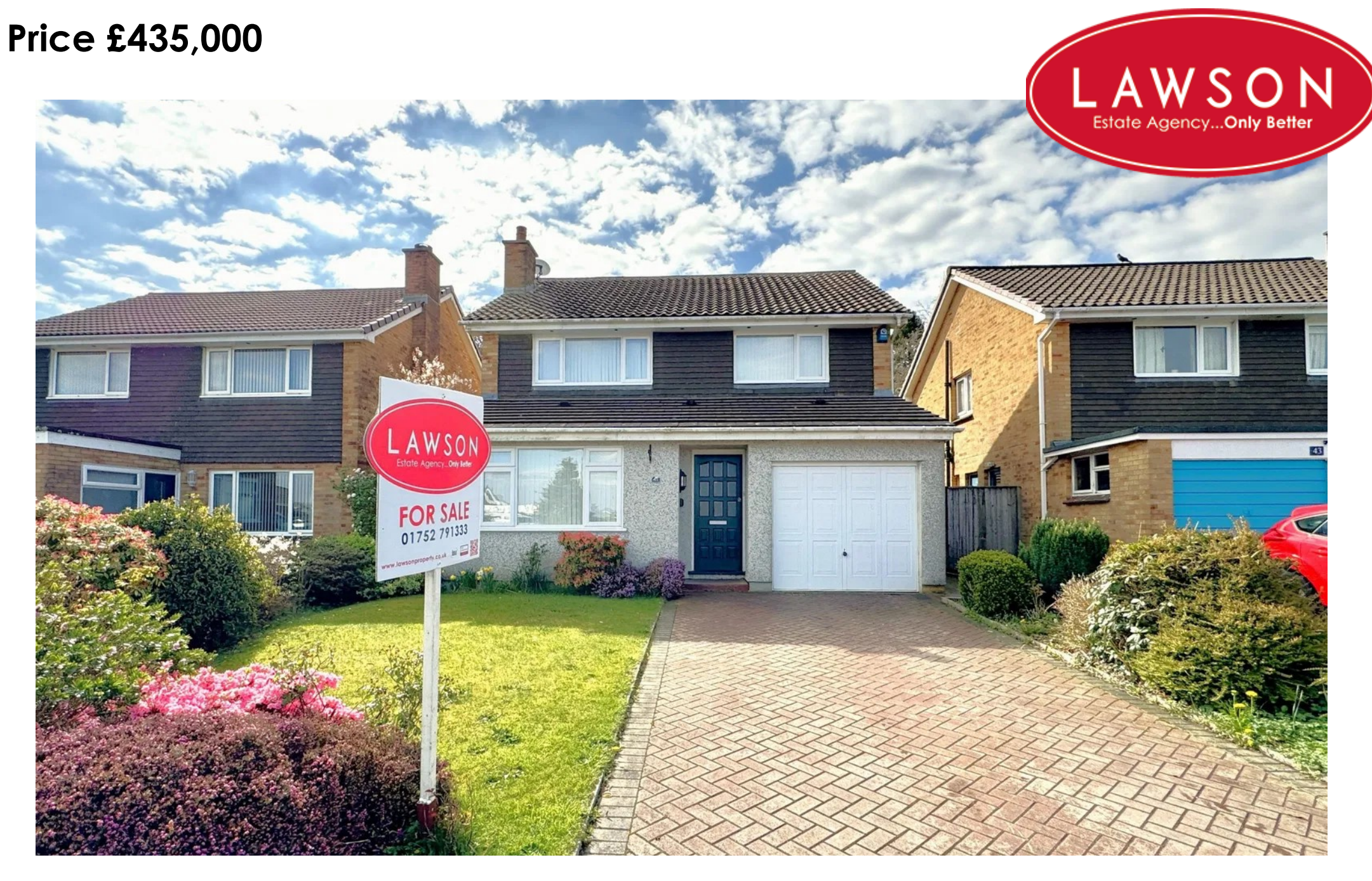
41 MOORLAND VIEW, DERRIFORD, PLYMOUTH, PL6 6AW