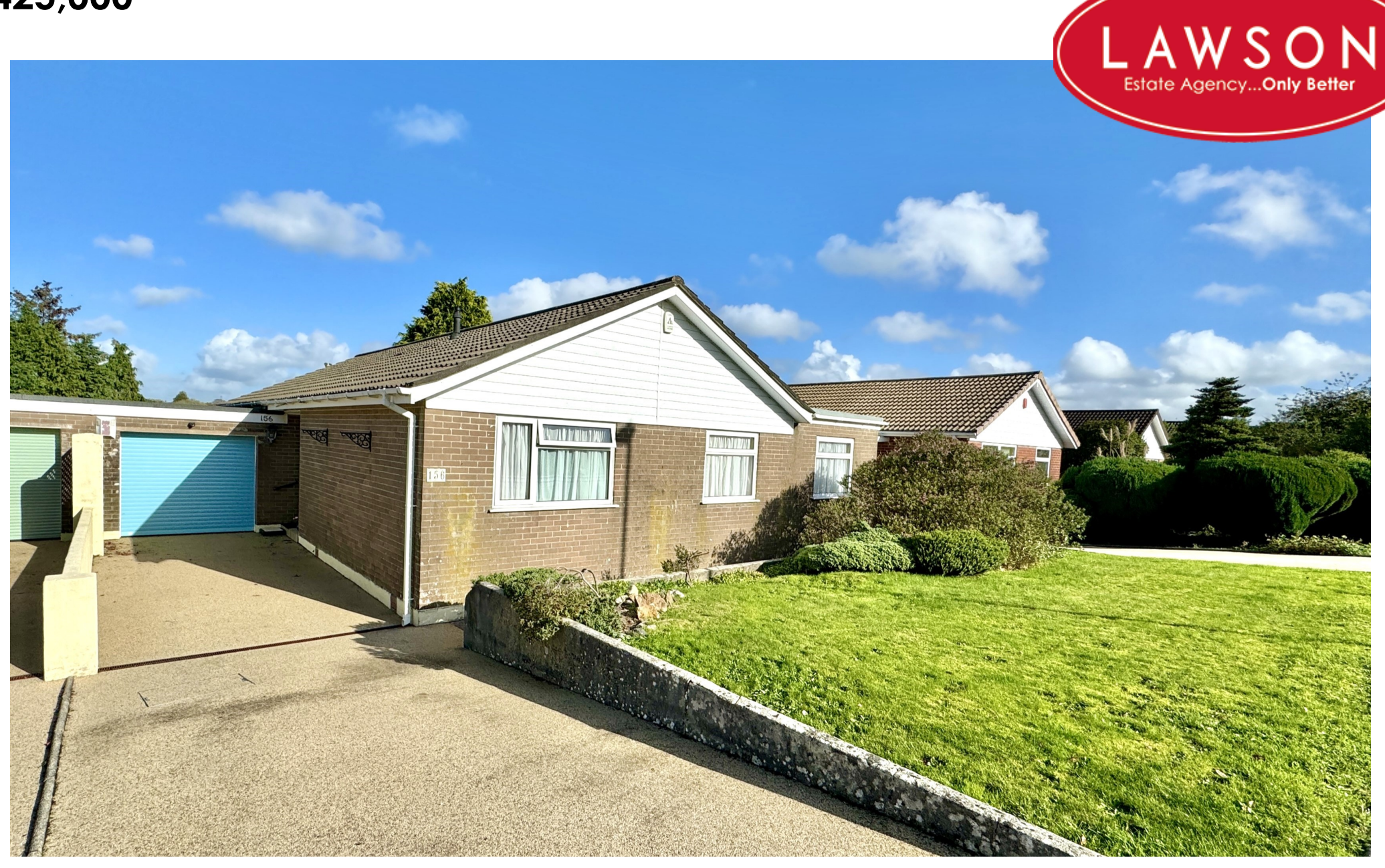
156 DUNRAVEN DRIVE, DERRIFORD, PLYMOUTH PL6 6AZ