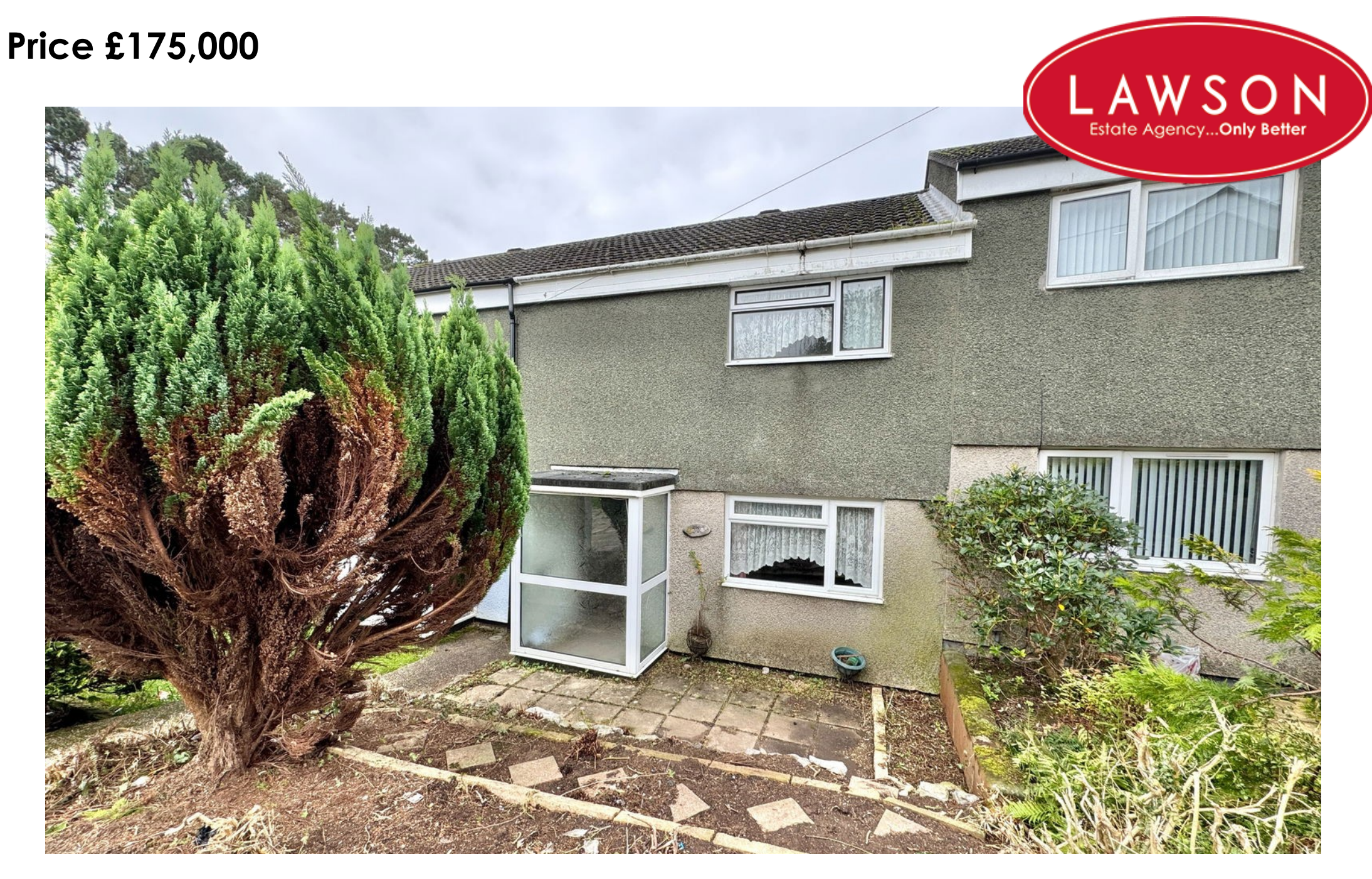
22 KIPLING GARDENS, CROWNHILL, PLYMOUTH, PL5 3DD