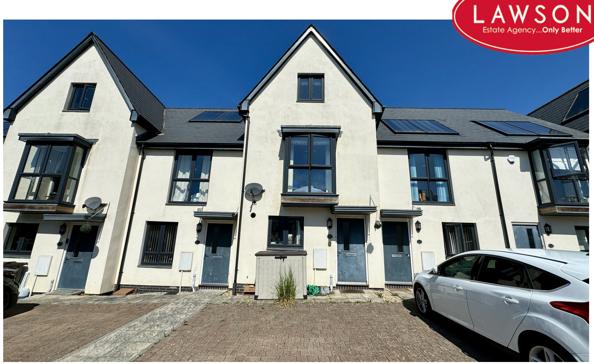
33 RADAR ROAD, DERRIFORD, PLYMOUTH, PL6 8DU