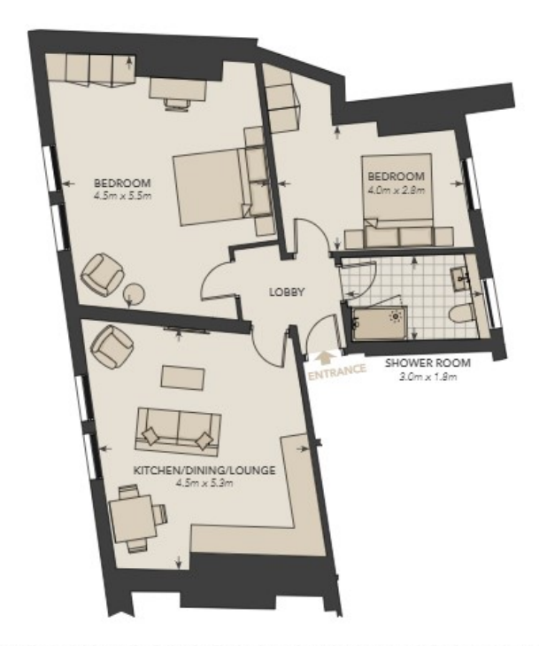
Gross Internal Floor Areas include gauages if applicable to plots. Floorplans shown are for approximate measurements only. Exact layouts and sizes may easy. All measurements may easy within a tolerance of 5%. The discousions are not intended to be used for earpet sizes, applicance sizes or items of furniture.