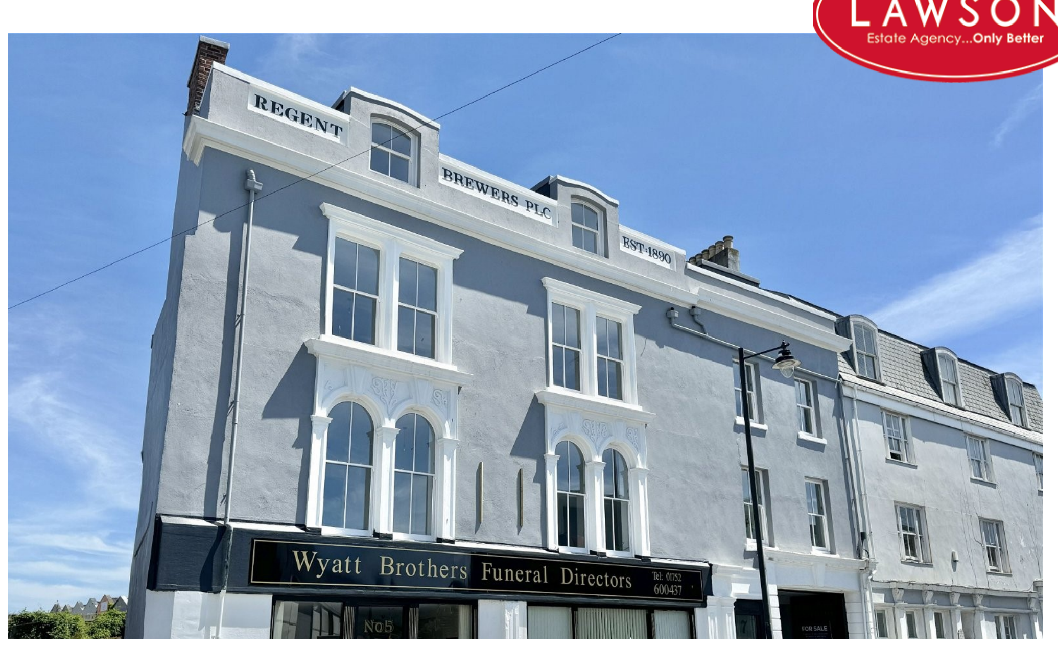
FLAT 4, 5-7 DURNFORD STREET, STONEHOUSE, PLYMOUTH, PL1 3QJ