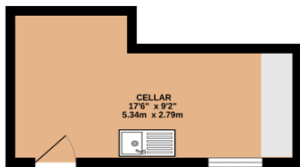
BASEMENT 139 sq.ft. (12.9 sq.m.) approx.