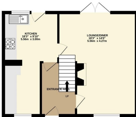
GROUND FLOOR 432 sq.ft. (40.1 sq.m.) approx.