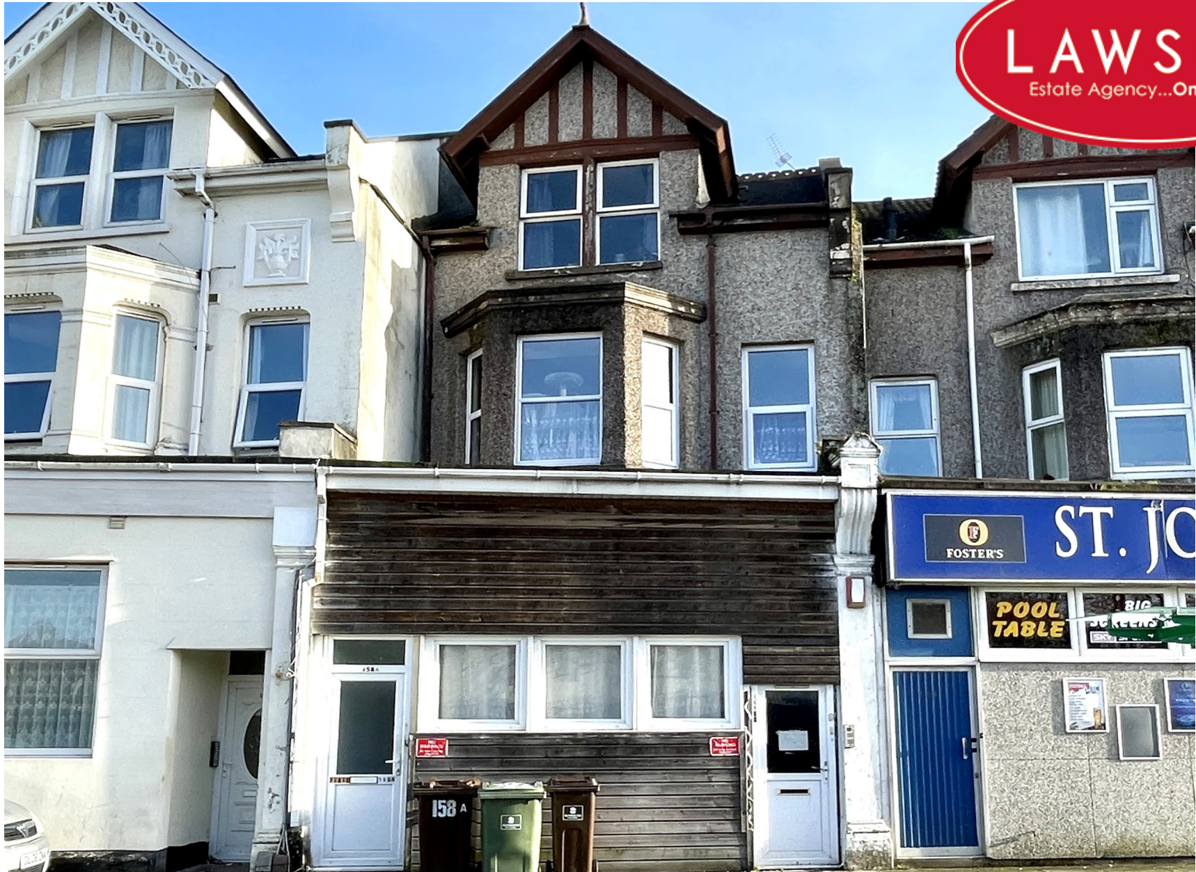
TOP FLOOR FLAT, 158 SALTASH ROAD, KEYHAM, PLYMOUTH, PL2 2BE