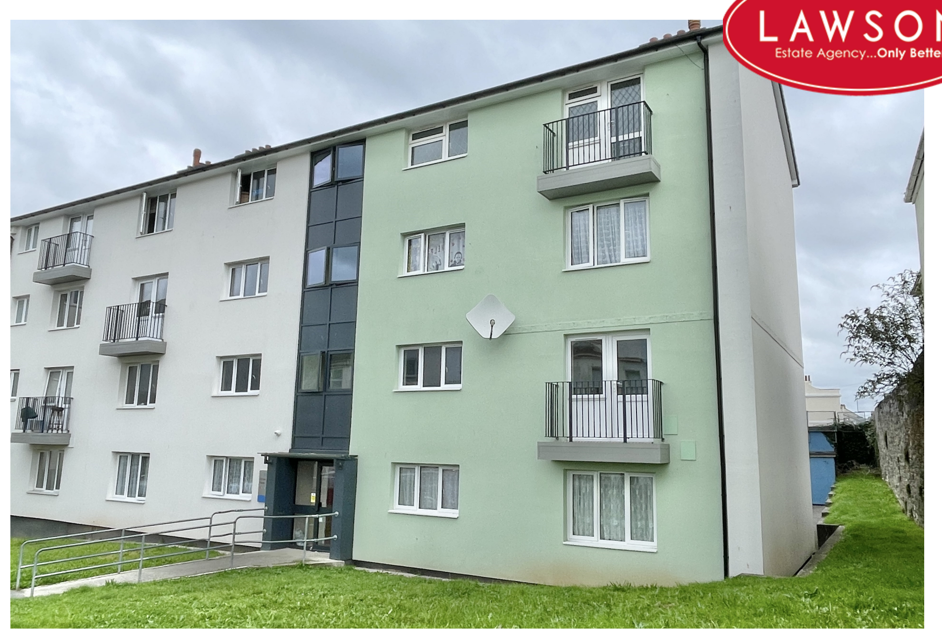
15 ST. LEO PLACE, DEVONPORT, PLYMOUTH, PL2 1SG