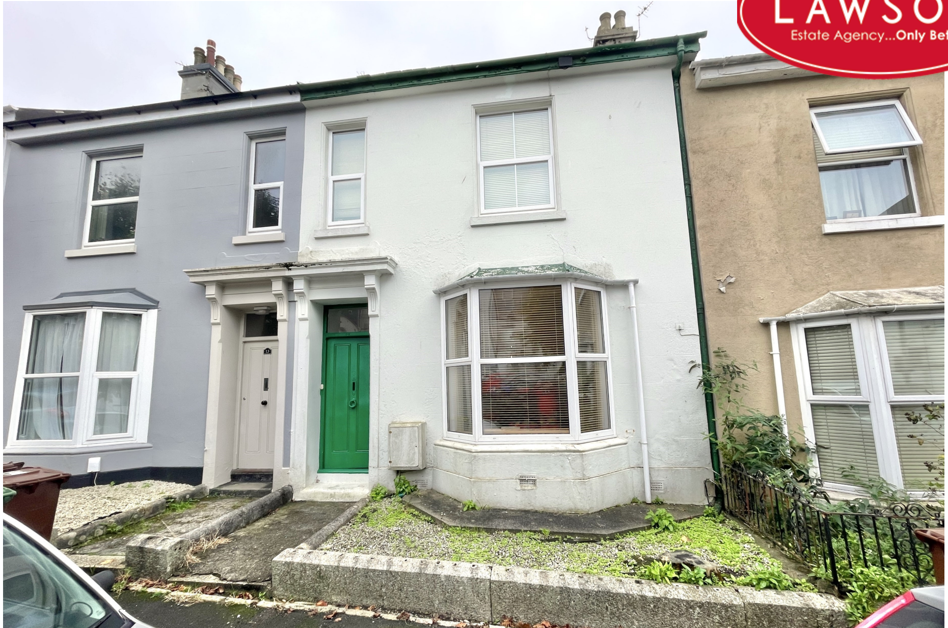
14 TREMATON TERRACE, MUTLEY PLAIN, PLYMOUTH, PL4 6QS