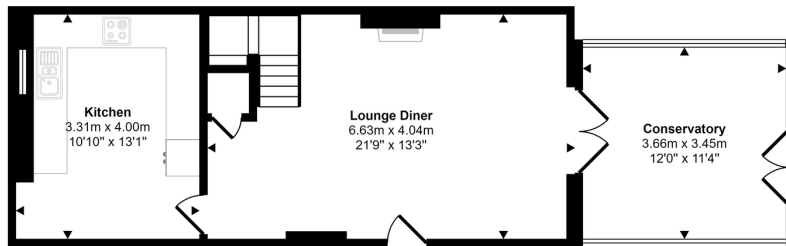
Ground Floor Approx 53 sq m / 572 sq ft

Approx Gross Internal Area 87 sq m / 936 sq ft