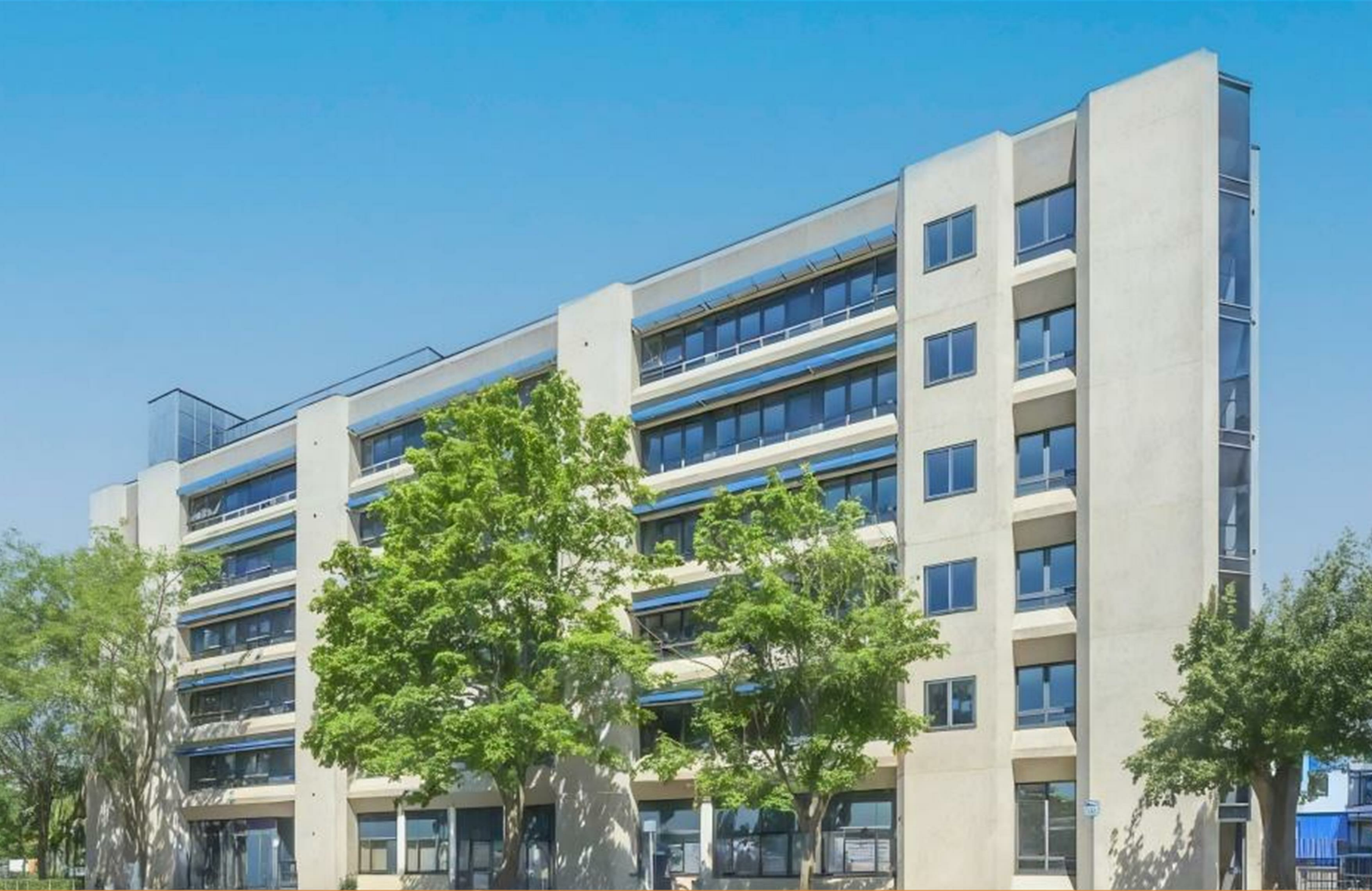
Skyline house, Swingate, Stevenage