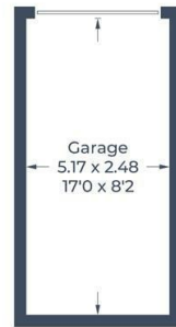
(Not Shown In Actual Location / Orientation)

Illustration for identification purposes only, measurements are approximate, not to scale. © CJ Property Marketing Produced for Chandlers