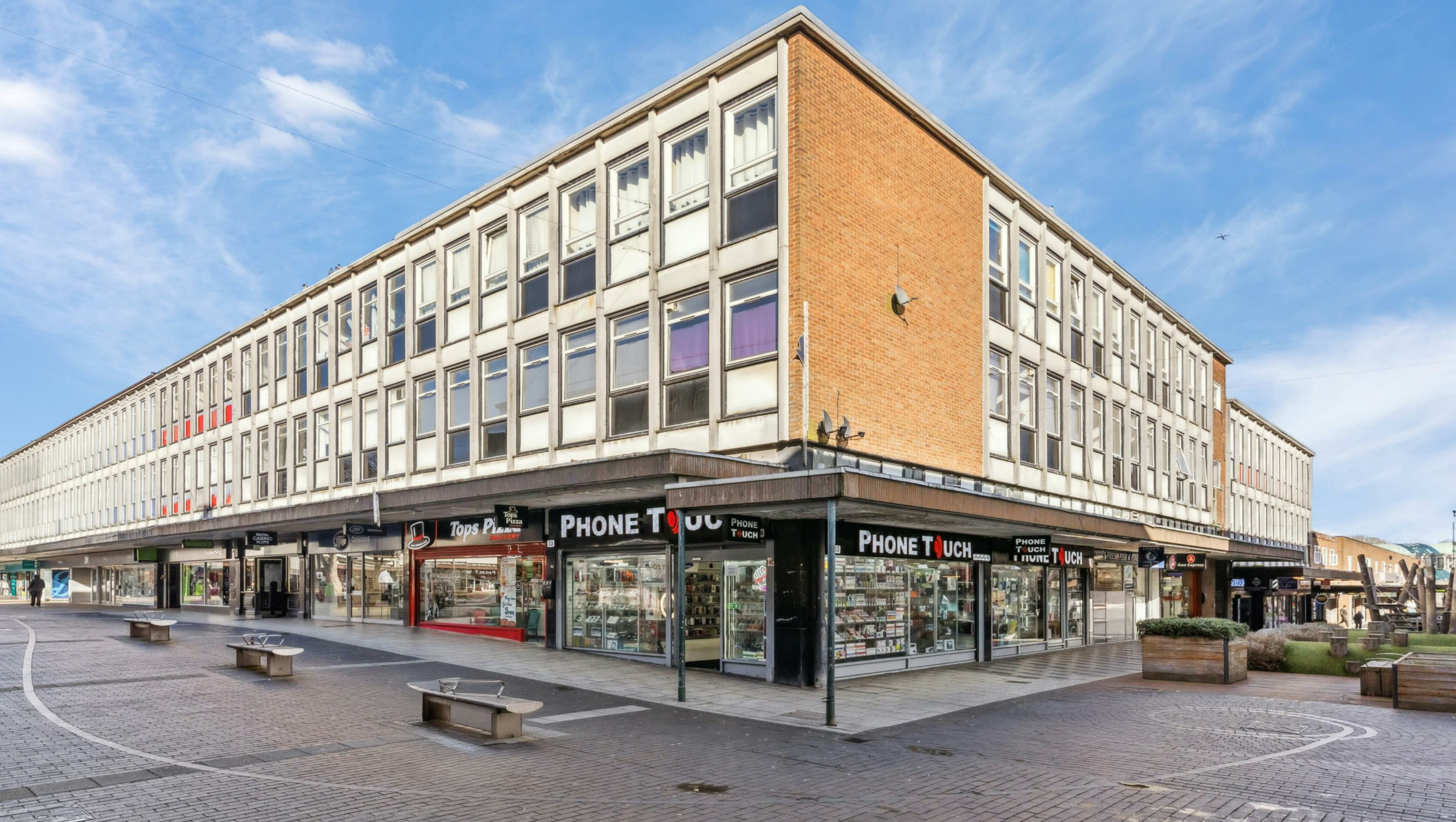
Market Place Chambers, Market Place, Stevenage