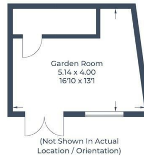
Illustration for identification purposes only, measurements are approximate, not to scale. © CJ Property Marketing Produced for Chandlers