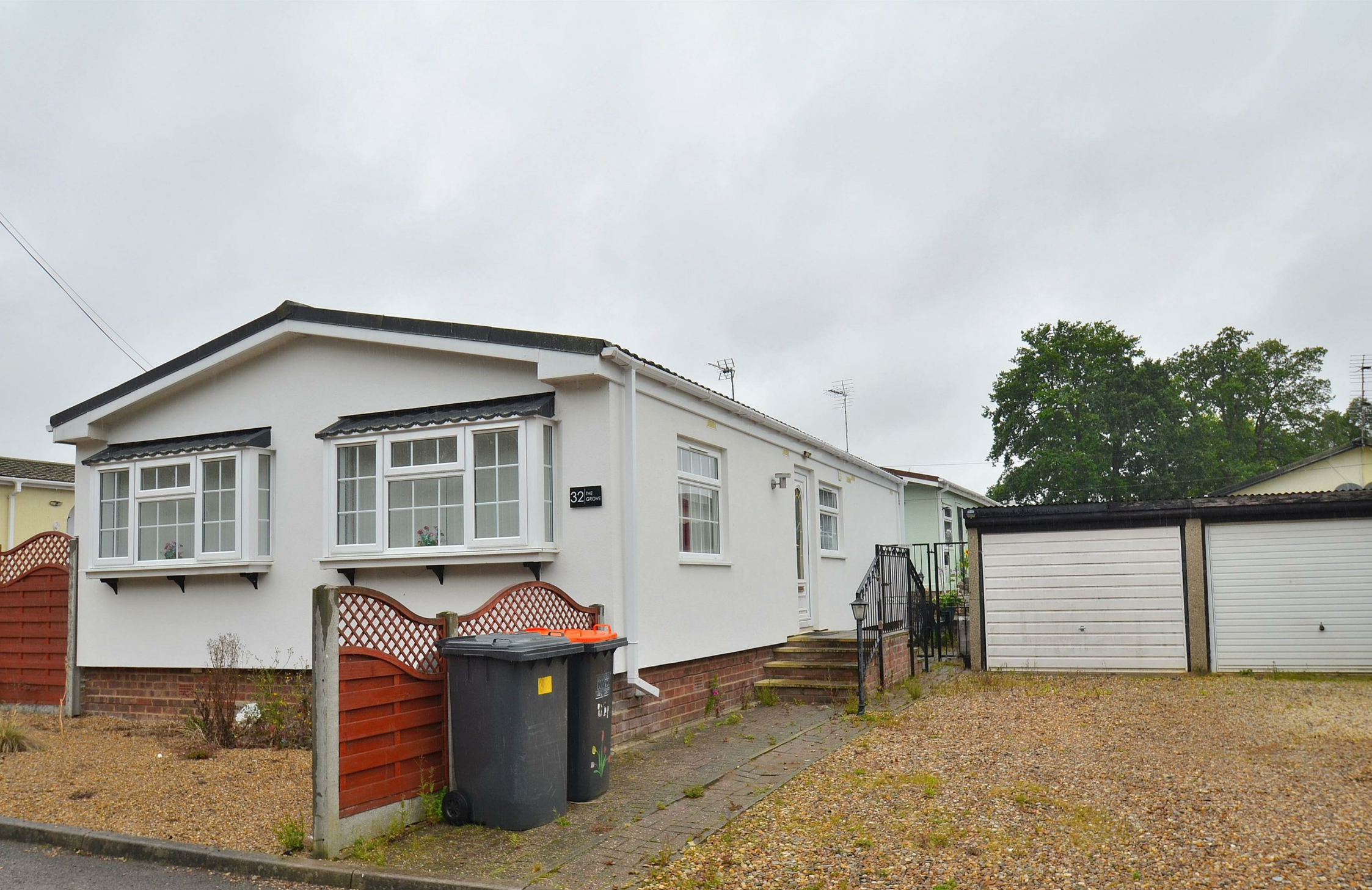
The Grove, Grove Park Road, Woodside