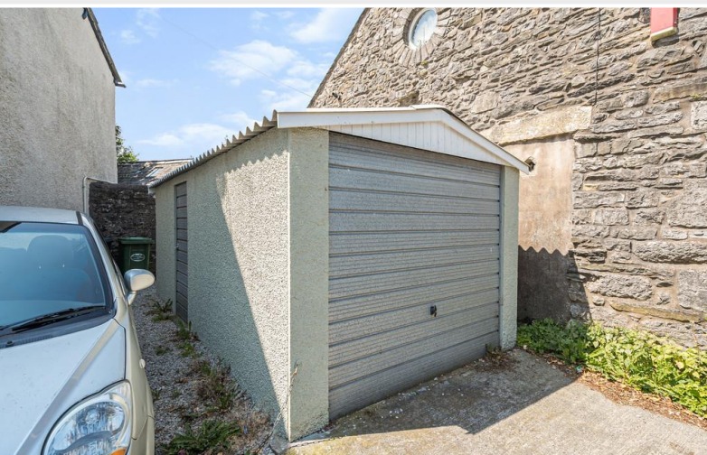
Garage and Parking Space

Accounts are available to interested parties, once viewed.