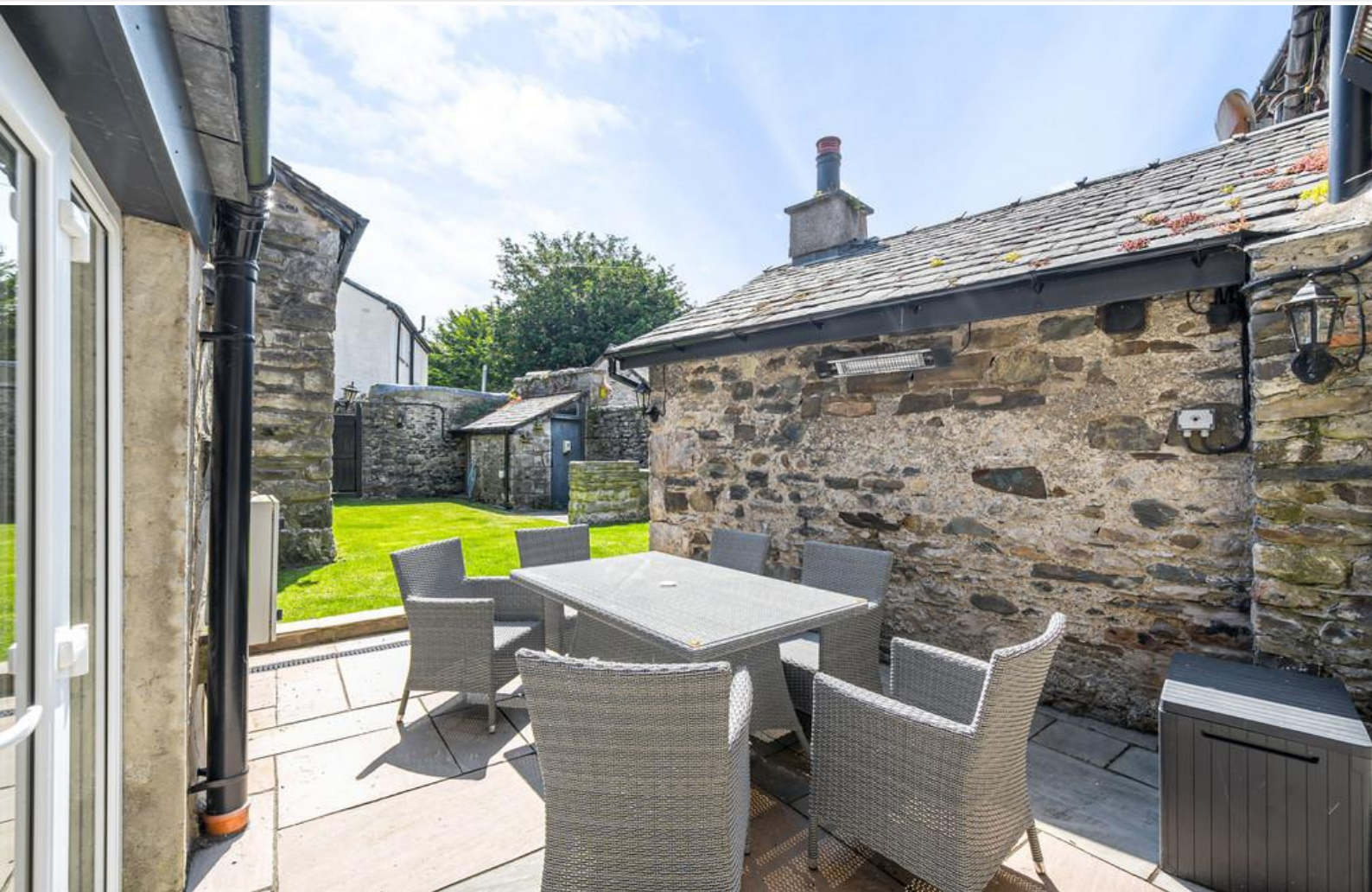
Patio and Garden