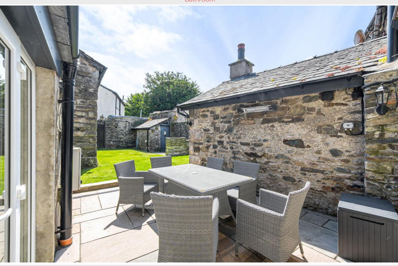
Patio and Garden