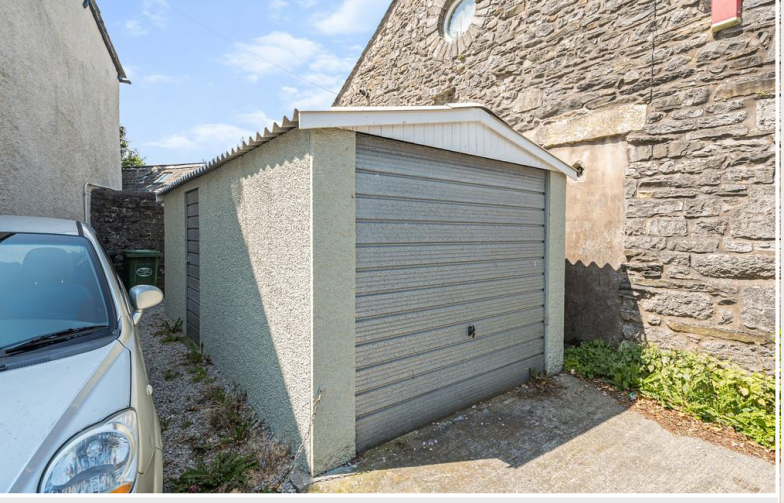
Garage and Parking Space

Accounts are available to interested parties, once viewed.