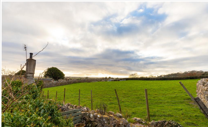
View from Patio Terrace