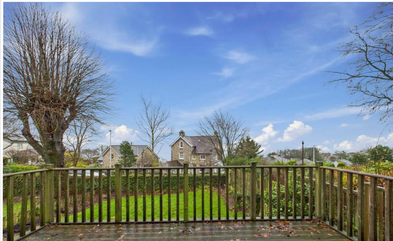
View from Living Room/Decking