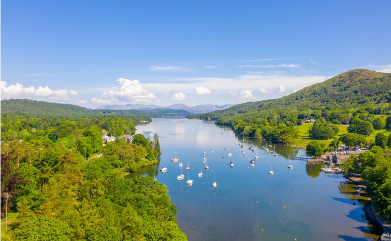
Lake Windermere closeby