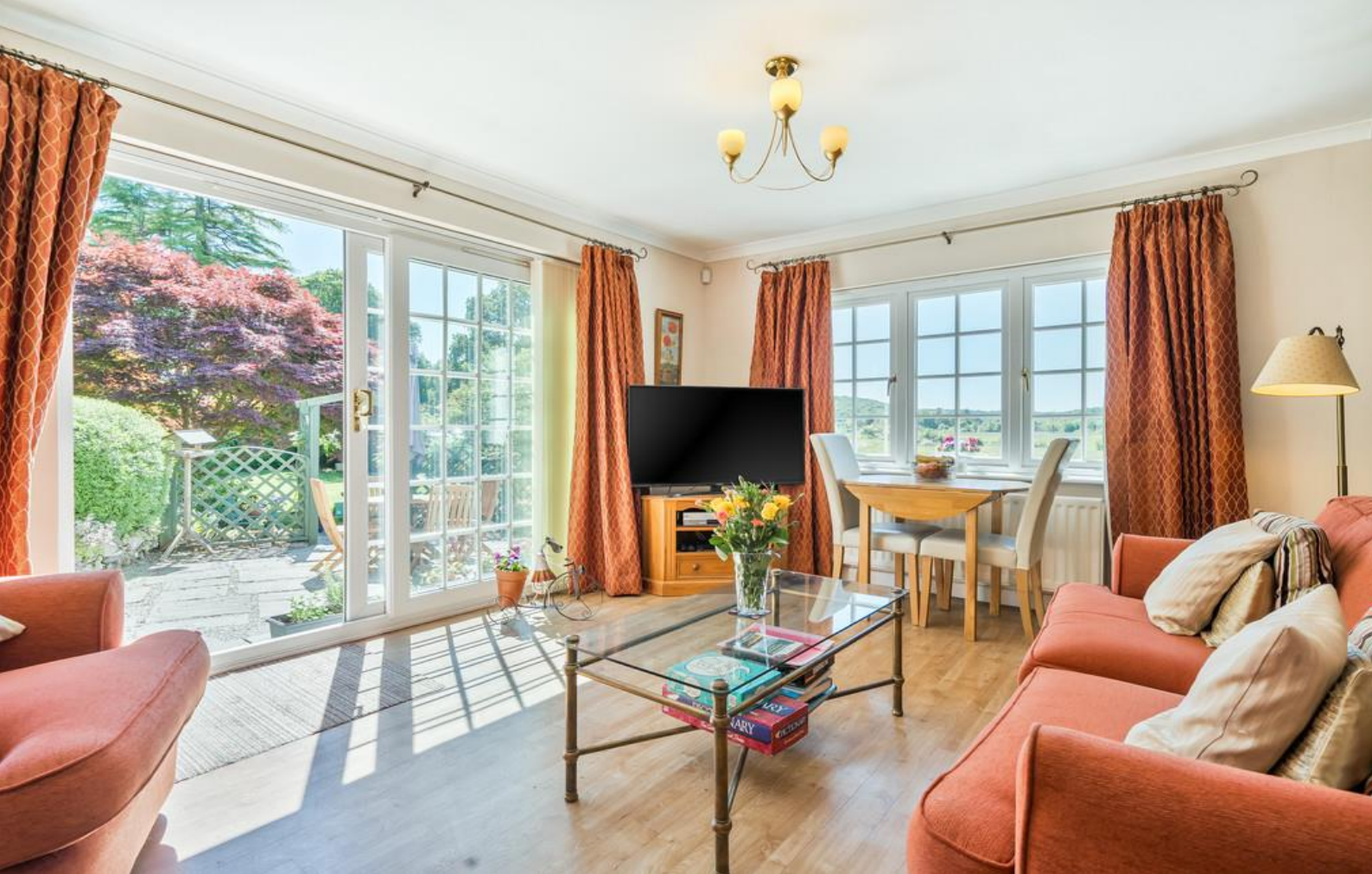
Annexe - Sitting Room