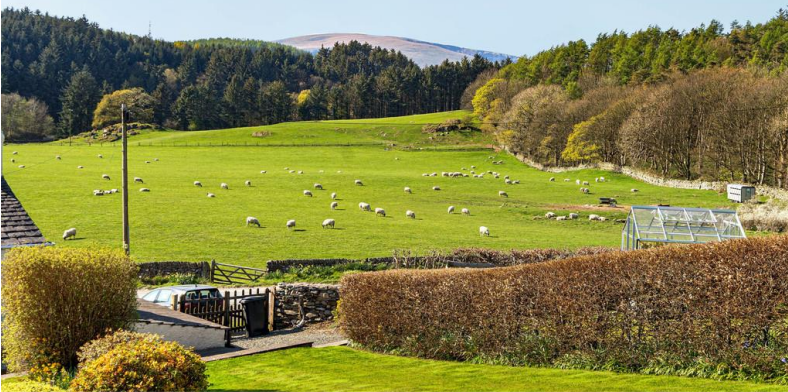
Garden and View