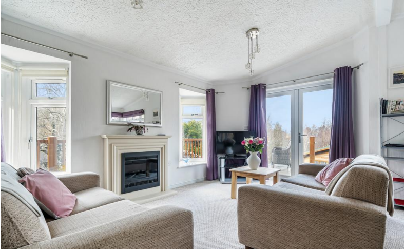
Open Plan Living/Dining Kitchen