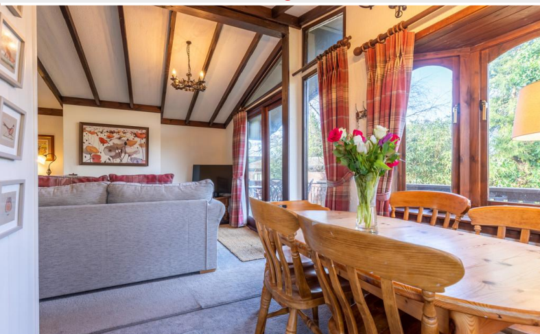
Dining Area to Lounge