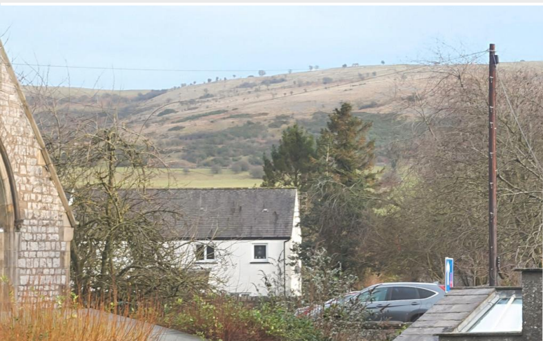
View towards Hampsfell

heating combi boiler. There is also access to an additional private patio area from the snug. To top it all off there is a gravelled off road parking space (a coveted commodity in Cartmel!).