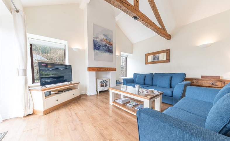
Open Plan Living/Dining Kitchen