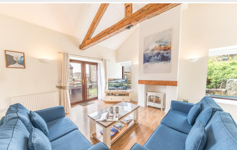
Open Plan Living/Dining Kitchen