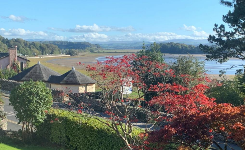
Views to Morecambe Bay