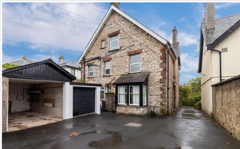
Rear Aspect and Garage