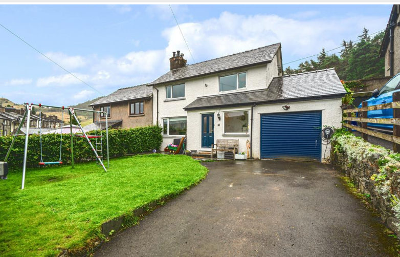
Front Garden and Driveway

However, Westmorland and Furness Council have indicated 'There is a potential for a buyer to apply for discretionary consent' - meaning there could be a possibility of purchasing this property as a permanent residence even if you do not comply with the stated local occupancy clause.