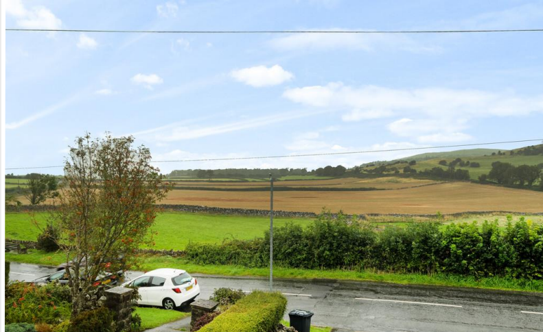
View to the Front

Anti-Money Laundering Regulations (AML): Please note that when an offer is accepted on a property, we must follow government legislation and carry out identification checks on all buyers under the Anti-Money Laundering Regulations (AML). We use a specialist third-party company to carry out these checks at a charge of £42.67 (inc. VAT) per individual or £36.19 (incl. vat) per individual, if more than one person is involved in the purchase (provided all individuals pay in one transaction). The charge is non-refundable, and you will be unable to proceed with the purchase of the property until these checks have been completed. In the event the property is being purchased in the name of a company, the charge will be £120 (incl. vat).