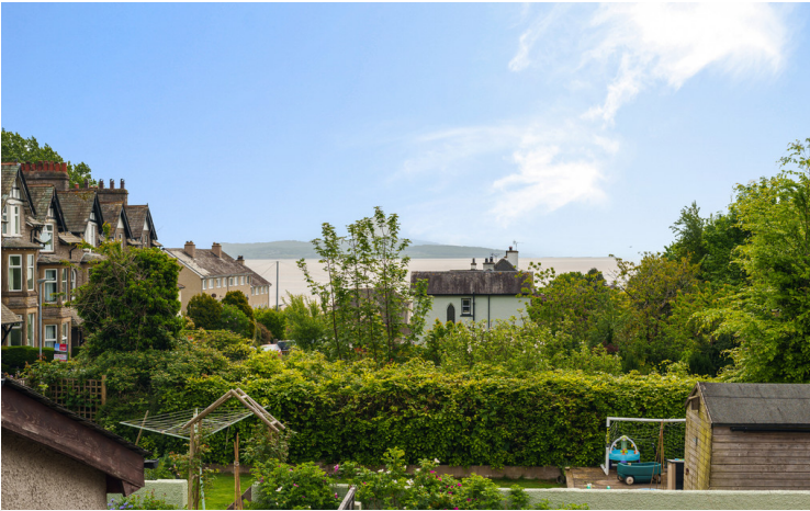
Views from Bedroom and Sitting Room