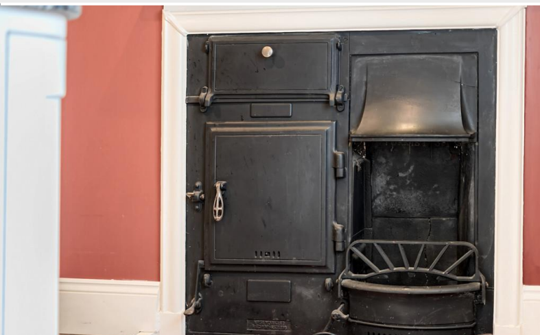
Fireplace in Kitchen