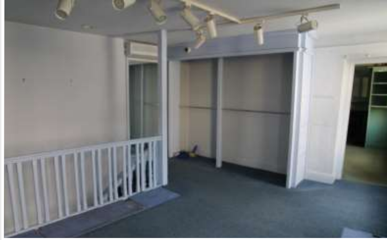
First floor sales area