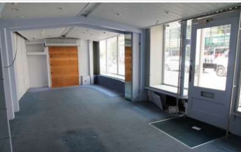
Ground floor sales area