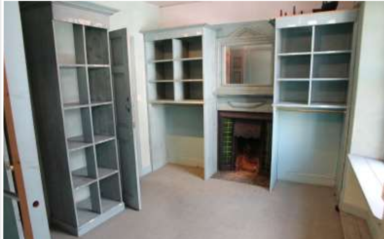
First floor sales area