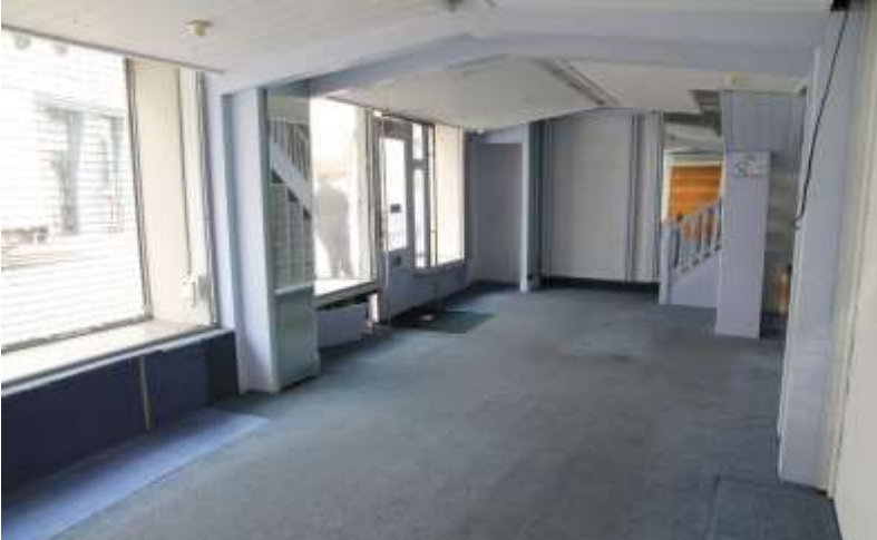
Ground floor sales area