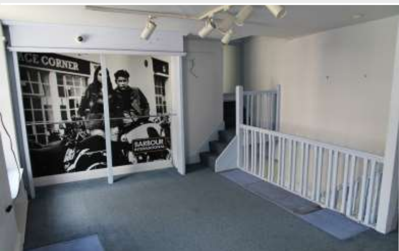
First floor sales area

Description: A fantastic investment opportunity to purchase a vacant 2 storey freehold shop in the beating heart of the thriving tourist village Bowness On Windermere having the added advantage of fronting both Lake Road and Ash Street.