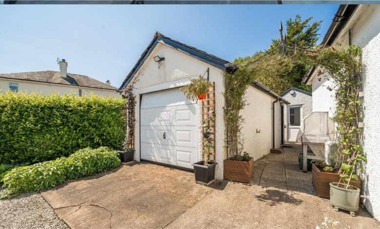
Garage with Workshop behind

Garage 15' 5" x 9' 10" max & 7'1" min (4.7m x 3m max & 2.17 min)