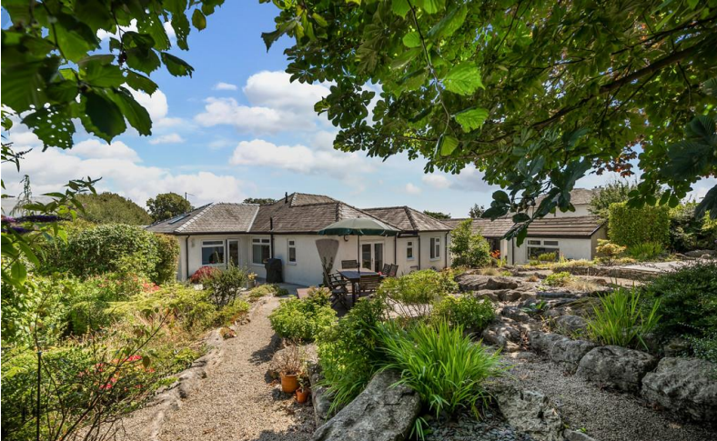
Rear Aspect and Garden