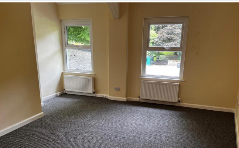
Open Plan Living Kitchen