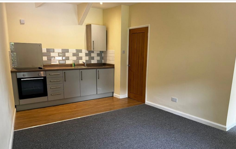
Open Plan Living Kitchen