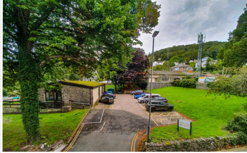
View from Open Plan Living/Kitchen

Rental Potential: If you were to purchase this property for residential lettings we estimate it has the potential to achieve £675 - £725 per calendar month. For further information and our terms and conditions please contact our Grange Office.