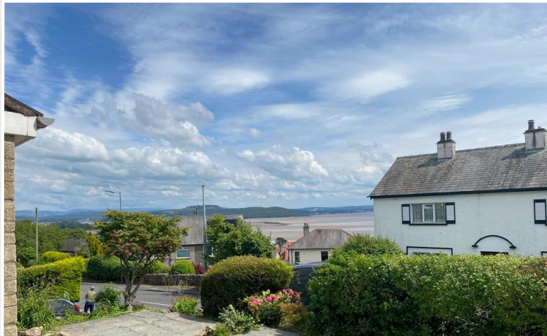
View from Kitchen