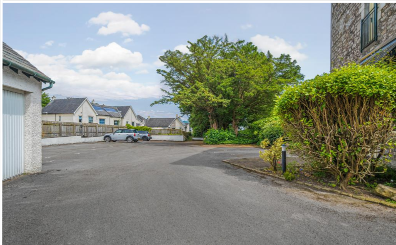
Car Park with designated spaces