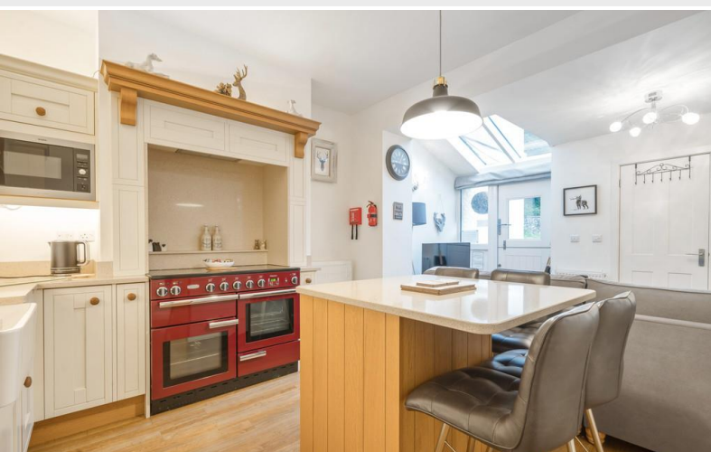
Open Plan Kitchen/Dining Area