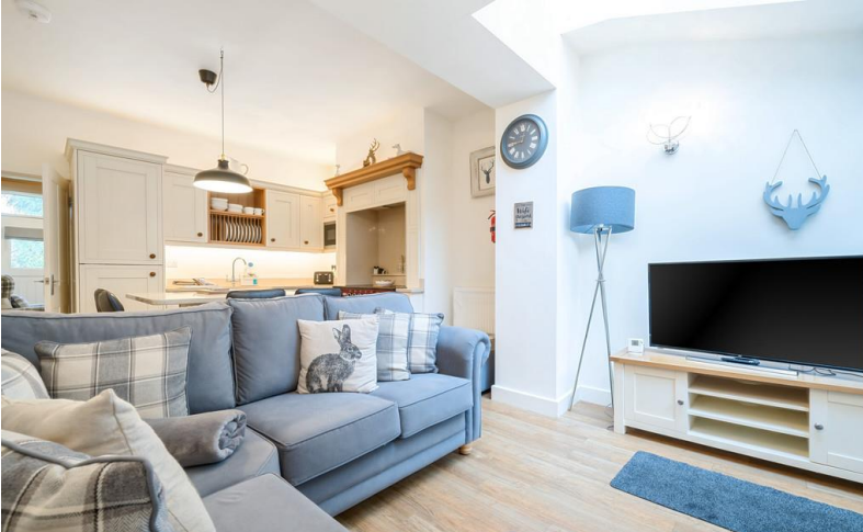
Open Plan Kitchen/Dining Area