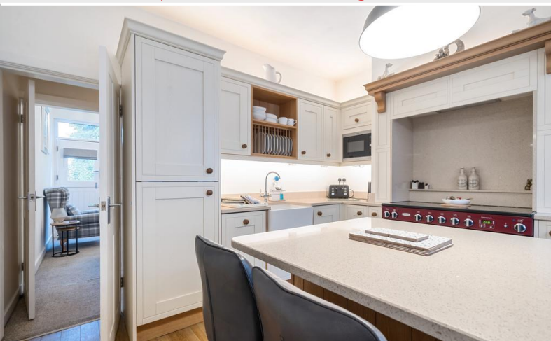
Open Plan Kitchen/Dining Area