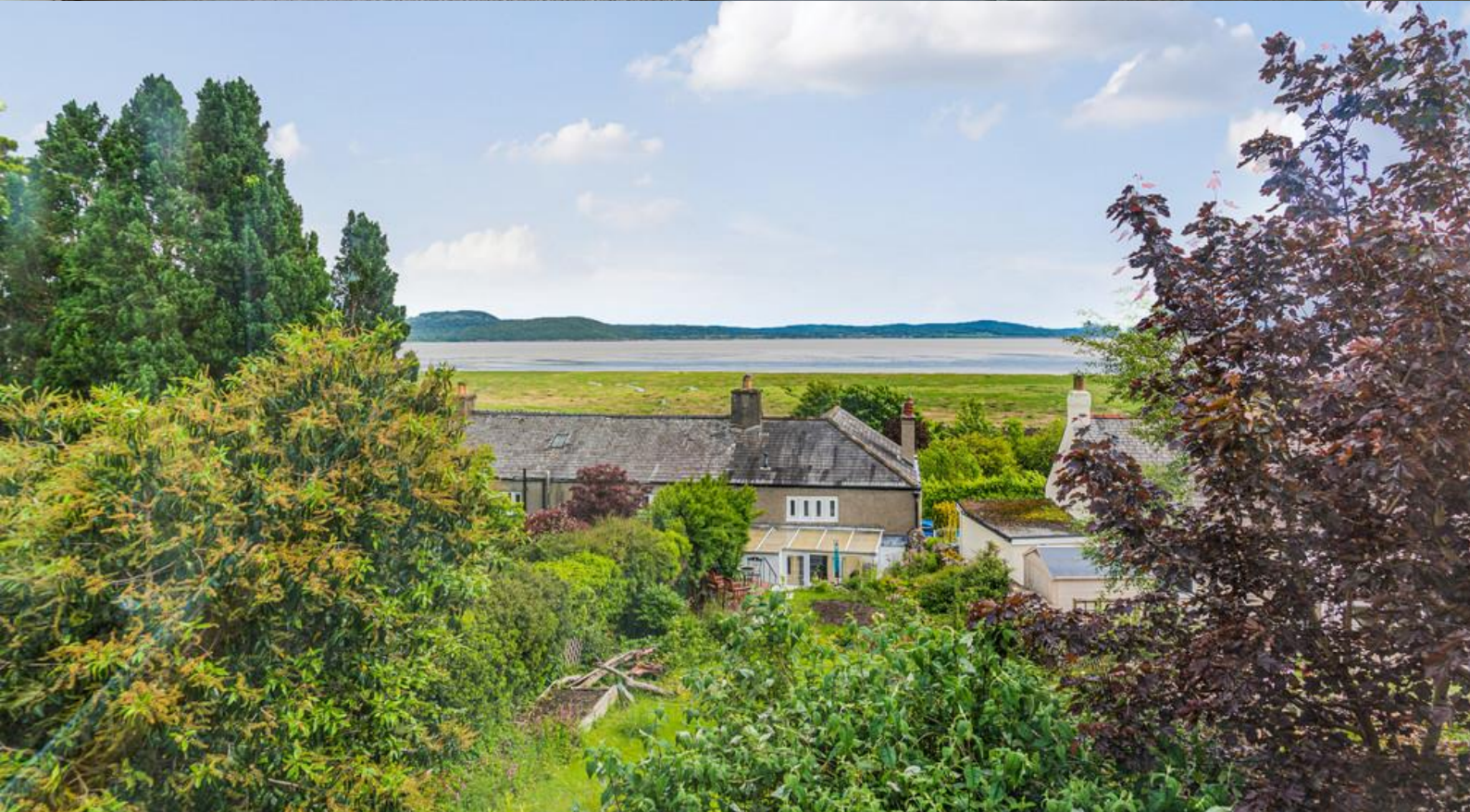
Views from toplights towards Morecambe Bay