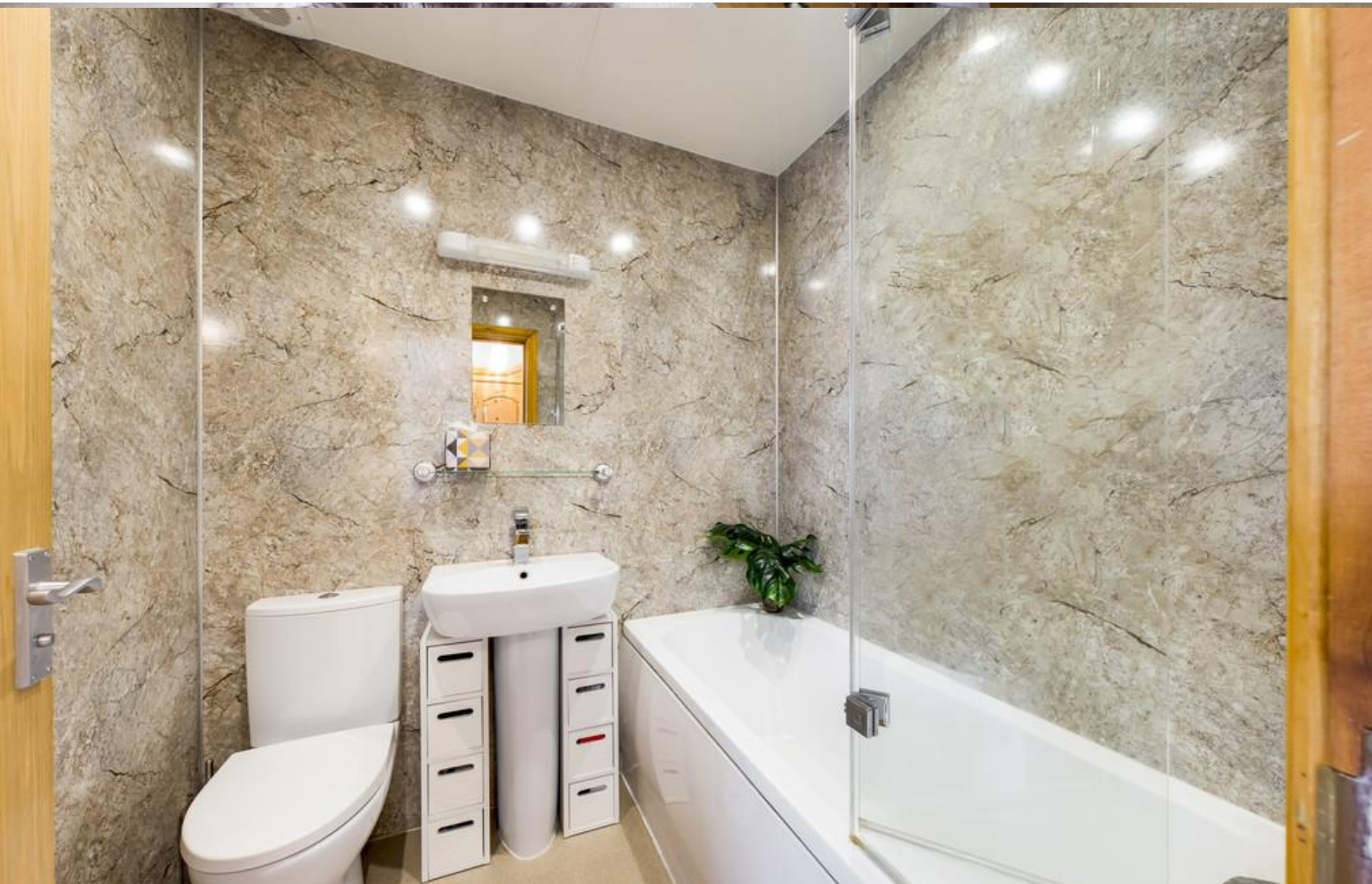
En-Suite Bathroom to Bedroom 1