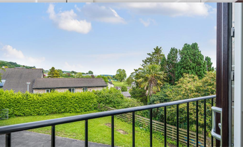
View from Open Plan Living/Dining/Kitchen