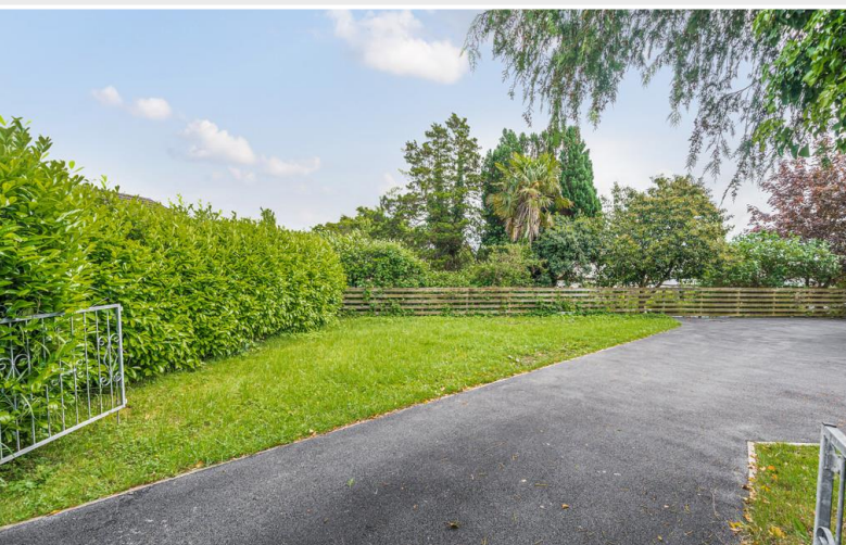
Driveway and Parking

Viewings: Strictly by appointment with Hackney & Leigh Grange Office.