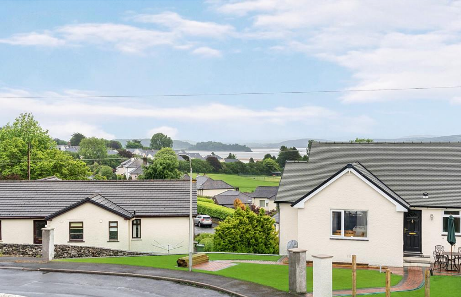
Views towards Morecambe Bay