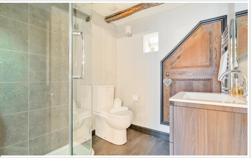
Bedroom 2 - En-Suite Shower Room